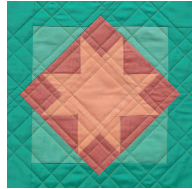
8. Teal green