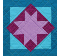
10. Ocean blue

To view your dedication online, please visit the virtual quilt: www.ahglendalefoundation.org/quilt.php