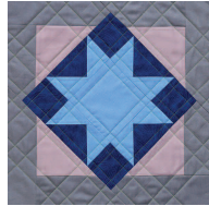
9. Slate grey