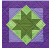
7. Royal purple